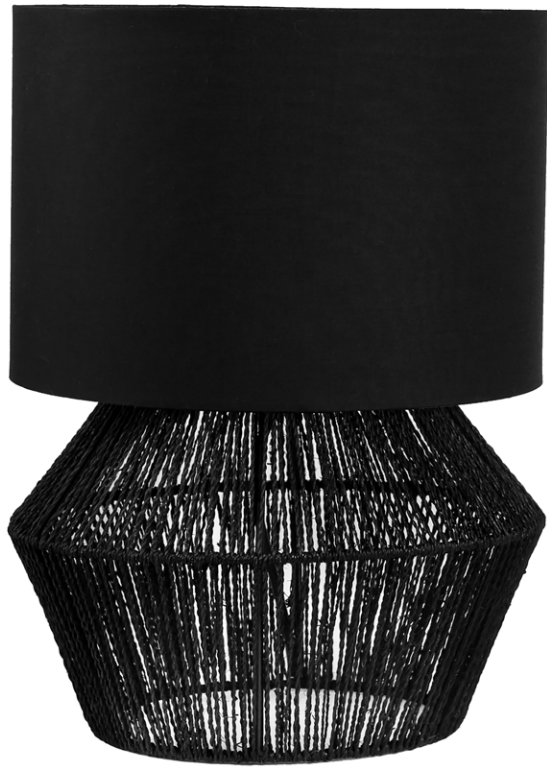
Table and Floor